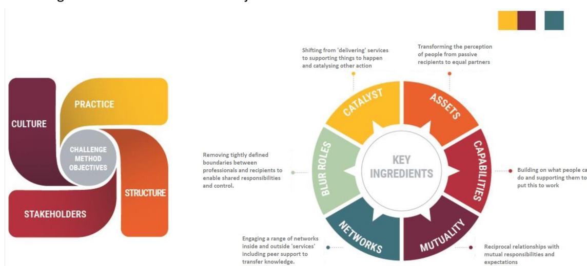
Figure 3: Quadruple Helix model implementation [10]

The implementation of WP3 objectives converges to a 9-step methodology (see above) that deploys our approach to open, collaborative innovation. We believe that this approach fully captures the complexity of the process and allows for innovation to occur iteratively at every step along the way, contributing to the full achievement of objectives of WP3.